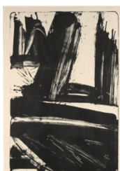
Willem de Kooning, Waves I (1960)