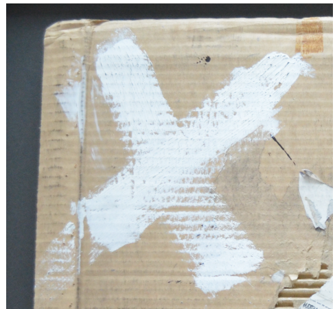
Close up of "X"