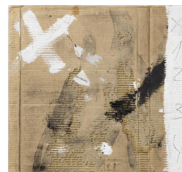
Antoni Tàpies, Untitled (1954)