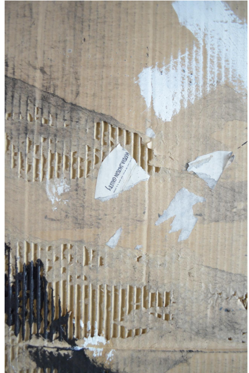
Close up of collage element